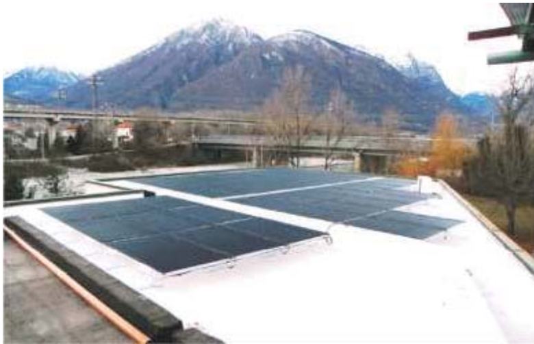
ARTE REAL ESTATE, PV SOLYNDRA, COOL BARRIER TECHNOLOGY, ITALY. Application on APP membrane.

Many already performed applications with Cool Barrier Technology and Solyndra's Cylindrical Solar Panels clearly demonstrate an increase in energy production even more than 20%. This is similar to hundreds of Sanyo's Hit double PV systems applications with Cool Roofs in most of the European Countries.